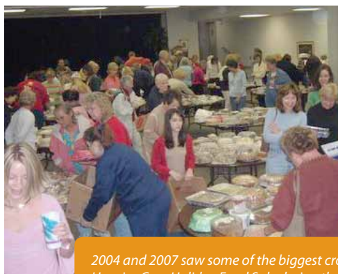
2004 and 2007 saw some of the biggest crowds of holiday shoppers enjoying the Tanner Hospice Care Holiday Food Sale during the past 20 years.

To learn more, offer to prepare a dish or volunteer, please call Tanner Hospice Care at 770.214.2355. 🍀