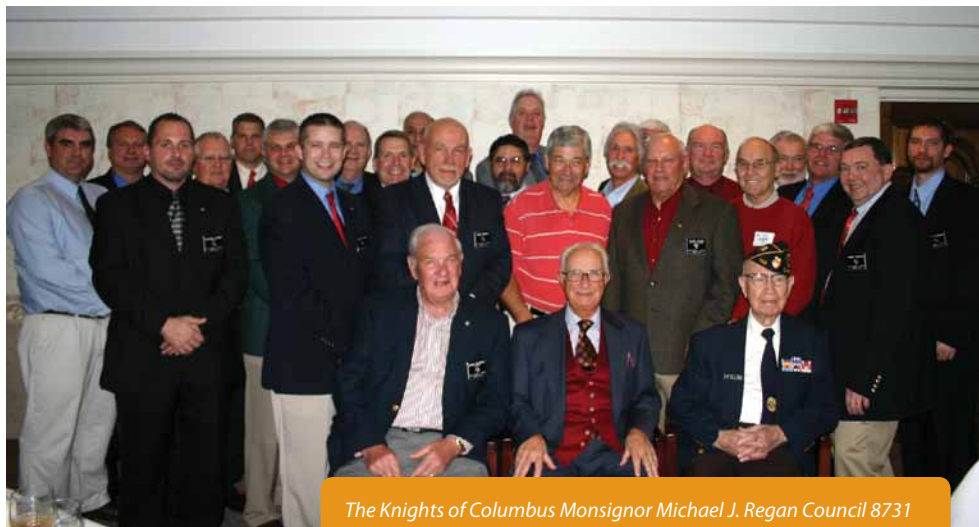
The Knights of Columbus Monsignor Michael J. Regan Council 8731

Donations like this one from the Knights of Columbus allow Tanner Hospice Care to provide services to anyone who needs them, regardless of their ability to pay. We greatly appreciate all who supported Tanner Hospice Care through The Knights of Columbus annual Golf Tournament. 🍀