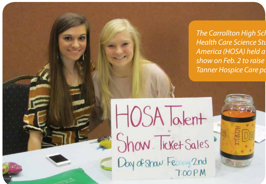
The Carrollton High School Health Care Science Students of America (HOSA) held a talent show on Feb. 2 to raise funds for Tanner Hospice Care patients.